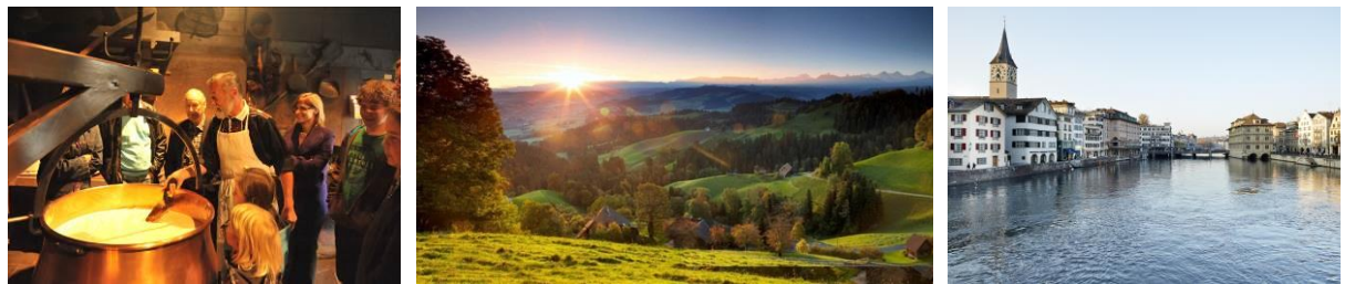
Emmental cheese dairy

Zurich is top for leisure and pleasure. Gentle hills, peaceful woods, the unpolluted lakes and rivers, picturesque villages – and all just a stone's throw from the Alps. Zurich is the ideal starting point for all kinds of varied excursions. Enjoy the pretty old town of Zurich, the trendy new Zurich West district and the glorious lake. With opera, ballet, theater premieres, shows, musicals, art exhibitions in over 50 museums and 100 galleries, time never drags in Zurich. The famous Bahnhofstrasse and the Limmatquai are a shopper's paradise. Over 1,700 restaurants and bars serve both traditional Zurich and Swiss dishes as well as exotic specialties. The evenings will leave you spoilt for choice: indoors or outdoors, anything is possible as far as the nightlife in Zurich goes.