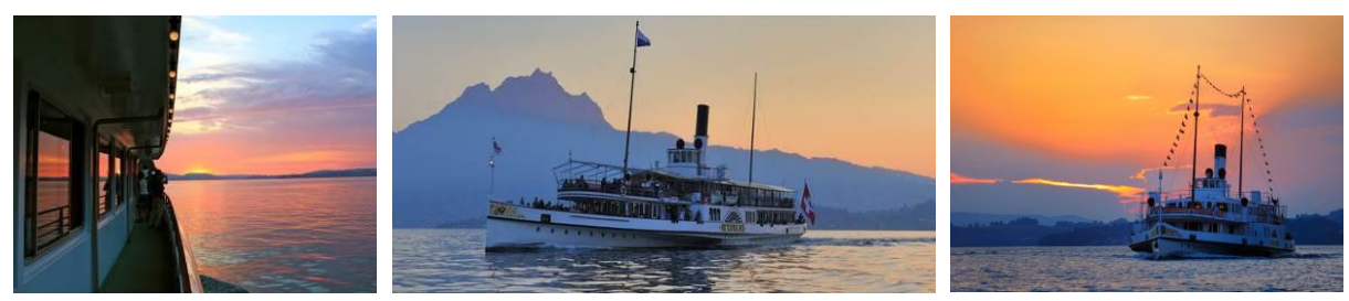
Sunset dinner cruise

See the sun set over Mount Pilatus while the paddle steamer gently glides over the tranquil water of the lake. Enjoy the vintage atmosphere onboard as you treat yourself to a drink on one of the deck chairs or to an exquisite meal in the ornate salon.