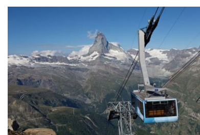
Cable car to Mount Rothorn

The underground funicular railway will take you from Zermatt up to Sunnegga. Here you can enjoy your first stop or continue right away by gondola and cable car to the gorgeous Rothorn. Of course, you can also hike this partly. From the peak of the Rothorn at 3103 meters there is the most spectacular view across the whole Zermatt region as far as the Matterhorn. On this walk around the Rothorn restaurant, yof 18 sculptures will connect you on an artistic level with the Alpine world of Zermatt and its many tales. On your way back, you can also walk some parts and see wonderful spots as the Stellisee for example. Your hiking guide will find the best fitting hike for you and not only this, he will also spoil you with a very typical Swiss picnic in the middle of the mountains.